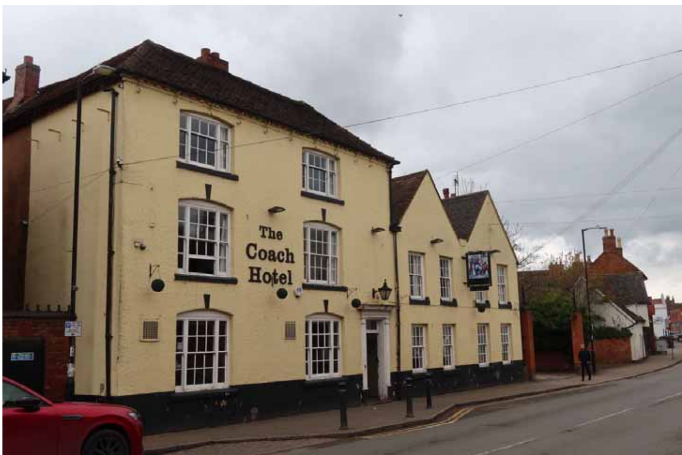
The Coach Hotel, Coleshill near where the stagecoach pictured on the front cover once stood